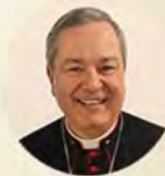
His Excellency Archbishop Santo Marciانو Italy

Celebrant and Homilist of the Opening Mass of the Congress