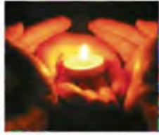
Light a Candle Enciende una vela