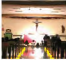
Say a prayer Haz una oración